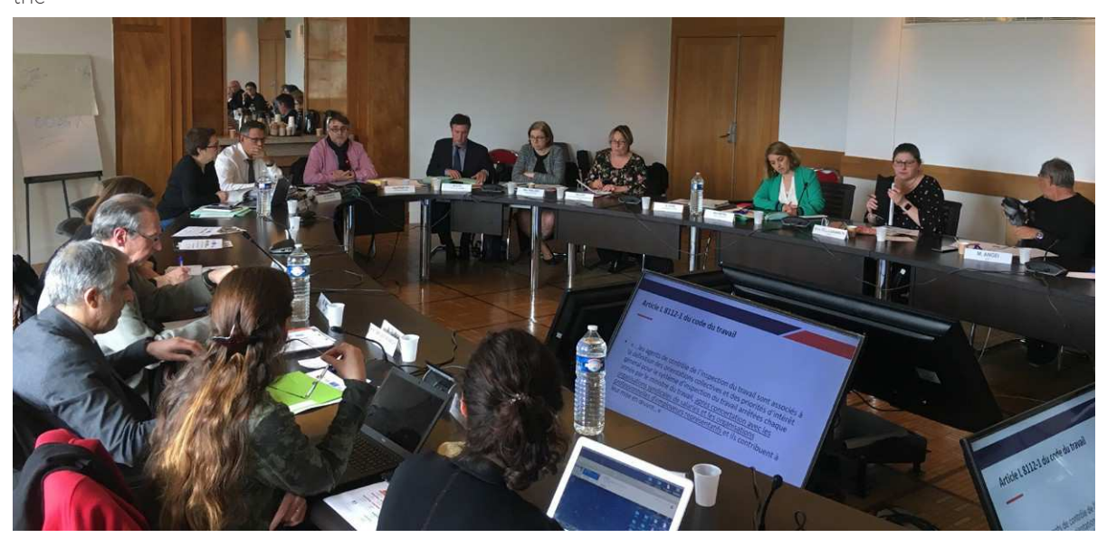
A meeting between the French National Commission on Collective Bargaining (commission nationale de la négociation collective) and the social partners.

The DGT is also regularly involved in the committee for the evaluation of bills (comité d'évaluation des ordonnances), which is steered by the public think tank France Stratégie.