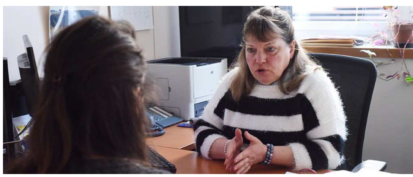
A local Labour Law information office.