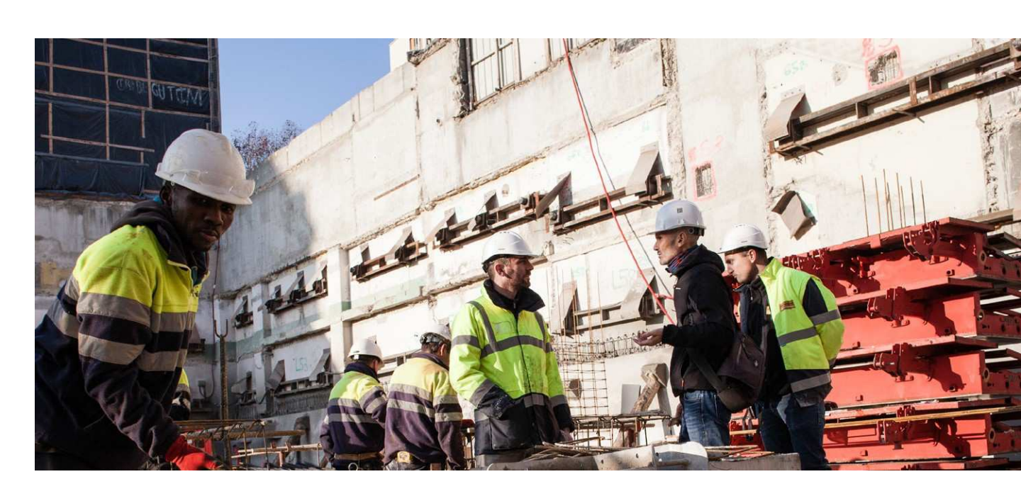
Inspection of a construction site in the département of the Hauts-de-Seine

Moreover, the Article emphasises that the General Directorate for Labour guarantees both respect for the rights, guarantees and obligations of labour inspectors, and compliance with their code of ethics.